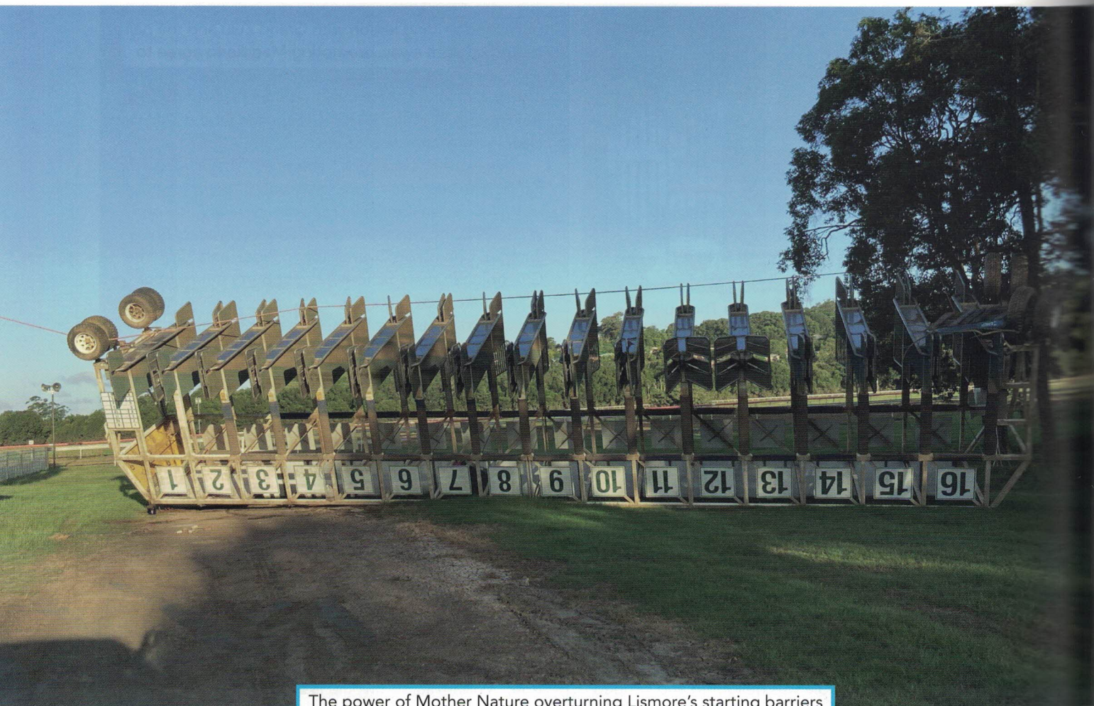
The power of Mother Nature overturning Lismore's starting barriers